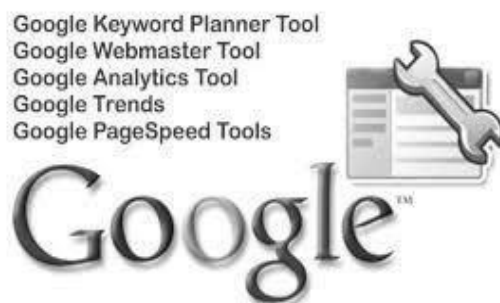
Fig 1.4 Google SEO Tools

Following are some significant rules given by Google to build positioning and making your page more improved • Submit your site page to Google at http://www.google.com/addurl.html . • Submit your site page and its sitemap in a XML structure utilizing Google Webmaster Tools. Google utilizes your Sitemap to find out about the structure of your website and to expand our inclusion of your Webpages. Remember to confirm your site first. • Make beyond any doubt every one of the destinations that should think about your pages know your website is on the web.