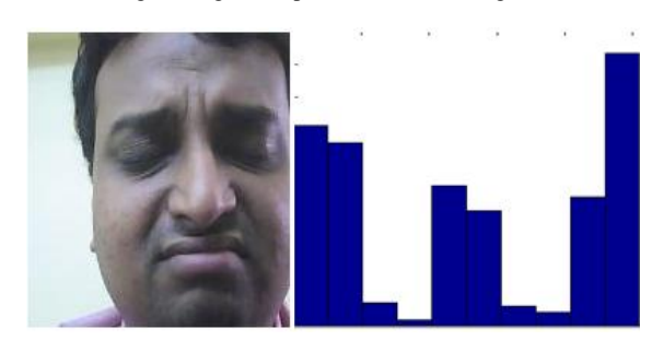
Fig 7: Image of Sad with its Histogram