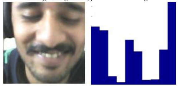
Fig 5: Image of cheerful with its Histogram