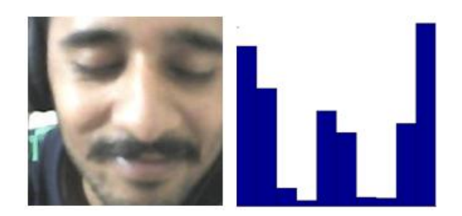
Fig 4: Image of Happiness with its Histogram